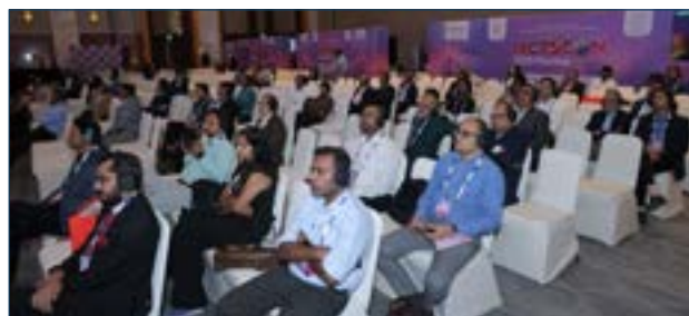
Head fones testify to multiple hall participation used for the first time