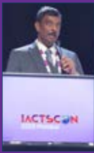
Your Secretary speaking.