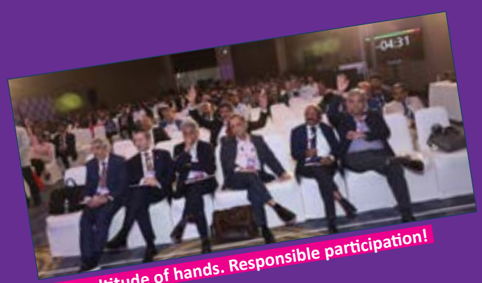
A multitude of hands. Responsible participation!