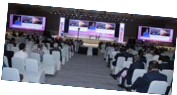
A grand stage