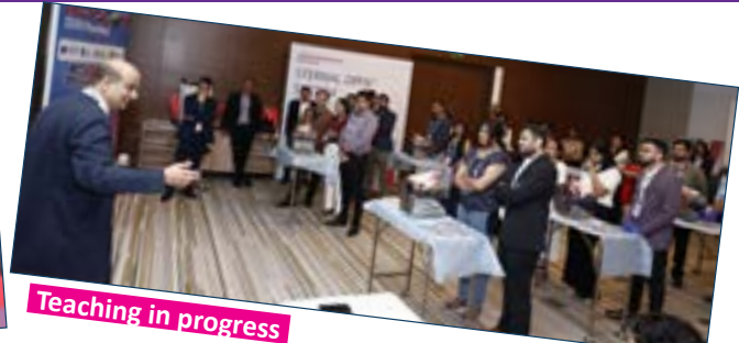
Teaching in progress